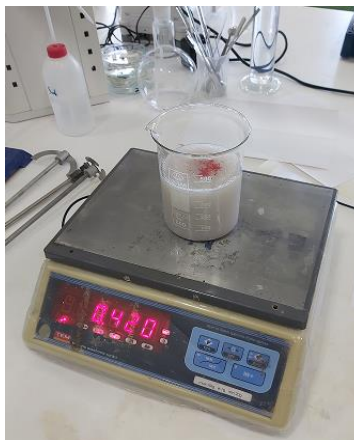
Fig. 1. Addition of red nano-pigment into varnishes

°C (for fungus). Antibiotic susceptibility discs including erythromycin (E15), ampicillin (AM10), and cycloheximide (Cyc) were used as control, and the negative control used was d H 2 O. The antimicrobial activity was evaluated by measuring the diameter of the inhibition zone. The tests were performed in triplicate.