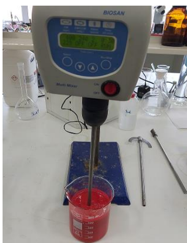
Fig. 2. Blending of red color nano-pigment into varnish via a mixer