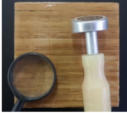
Fig. 1. Adhesion test