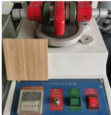
Fig. 2. Abrasion resistance test

A hole was punched in the center of the coated test material, referring to the GB 23999 (2009) standard, under the gravity of 750 g, with 500 r as the test revolution, 60 r/min rotation speed, and recorded the sample grinding. The mass after pre-grinding and the average weight loss (AWL) were calculated to test the AR of water-based coatings.