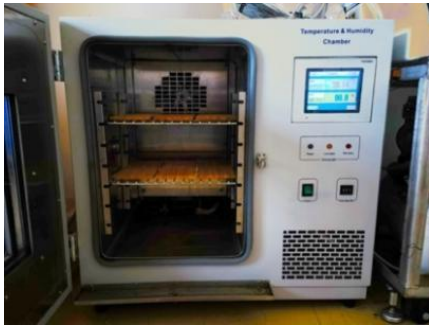
Fig. 4. Temperature change resistance test

According to GB/T 4893.7 (2013) method, the dried painted samples were treated for 1 h in a constant temperature and humidity box with a temperature of 40 °C and a humidity of 95%. After the treatment, the samples were immediately placed at -20 °C for 1 h. After 3 repeated cycles, the sample was observed by a 4x magnifying glass starting at 20 mm from the edge of the sample to the surface of the coating in the middle of the samples. If any defects such as cracks, bubbling, obvious loss of light, and/or discoloration appeared, the sample was rated as unqualified.