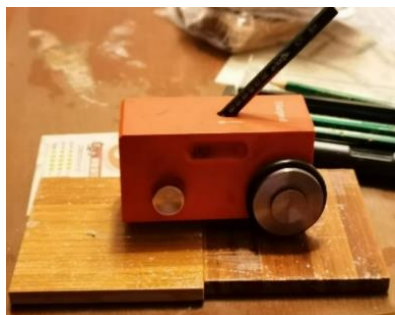
Fig. 3. Hardness test

The hardness of the coating was tested with a scratch tester composed of a series of pencils with the hardness from the hardest 6H to softest 6B according to the GB/T 6739 (2006) standard. The pencils with different hardness were inclined at 45° to the coating and scratched the coating under a load of 1 kg. When the coating began to have scars, the hardness of the pencil was taken as the hardness of the tested coating.