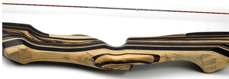
Fig. 2. Example ILF manufactured product: bow.

ILF is a method for wood-based AM that involves the layer-by-layer fabrication of objects using a computer-controlled milling machine. This method has been shown to be suitable for the production of large-scale objects, such as furniture and building components (Henke et al. 2021). Recent studies have demonstrated the use of ILF for the production of customized wood-based objects, such as chairs and tables (Krapež Tomec and Kariž 2022).